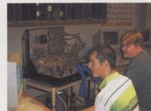
15 Learning Experience