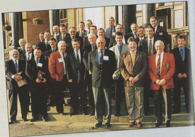
Golden and Silver Key supporters at the Chairman's lunch, BTME 2000 in Harrogate