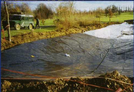
Donnington Grove Golf Club: Pond Liner