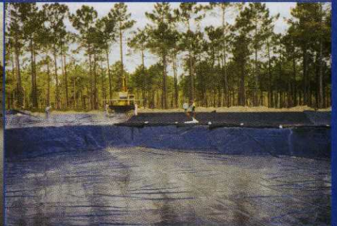
Aroeira Golf Club, Portugal: Lake Liner