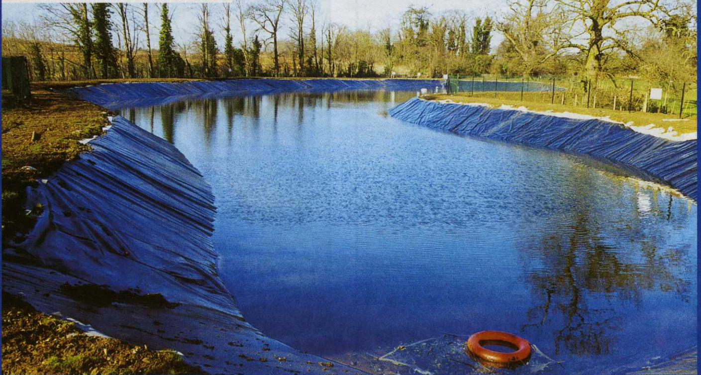
Hanbury Manor Golf Club: Reservoir Liner