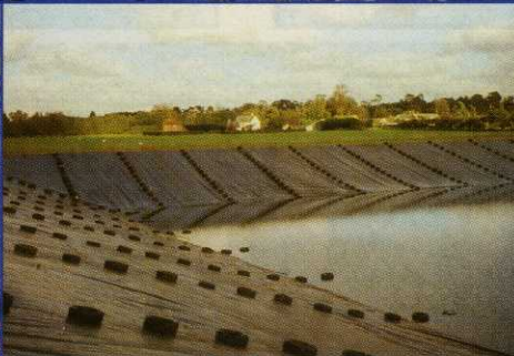
Frilford Golf Club: Irrigation Reservoir Liner