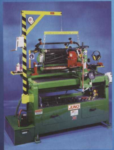
Juno 36" capacity cylinder and bottom blade grinding machine. Accurate 'relief grinding', full 'in-situ' capability & fully water cooled. Cost effective, simple and fast!

Cut service costs! Improve cutting standards! Reduce wasted downtime!