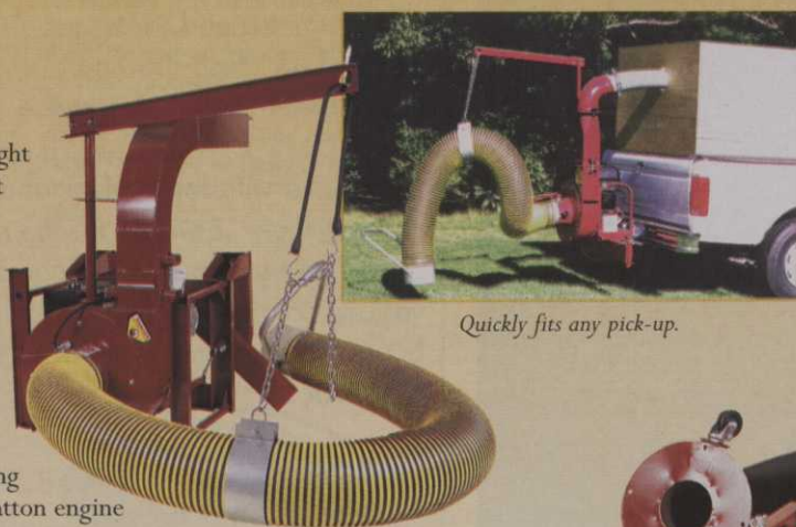
Quickly fits any pick-up.

This is the professional way to shift mountains of leaves and light debris into trucks for transport or removal. The tailgate model complete with 8" x 10' Intake Hose Kit and 11hp heavy duty Briggs and Stratton IC engine will fit most pick-up vehicles by simple hand-clamp attachment to tailboard. Also trailed model complete with 10" x 10' Intake Hose and Spring Boom and 11hp Briggs and Stratton engine to suit ANY vehicle.