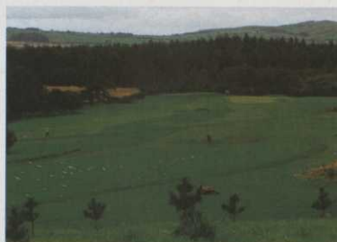
45 Pining for Home