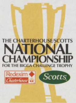
22 National Championship