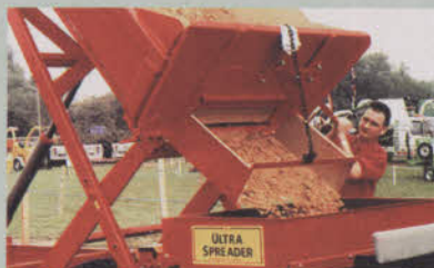
HL40 Highlift Trailer. For loading top dressers, gravel/sand hoppers, bunkers, etc.