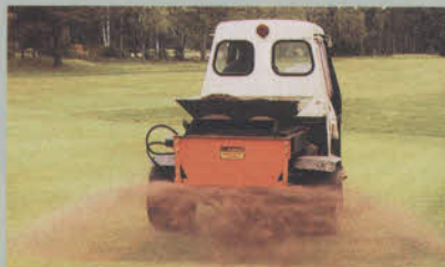
UB30S Spinner Top Dresser. Spreads to 5 metres. Ideal for regular light dressings of Greens and Tees.