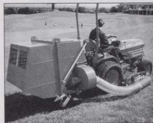
Material Collection Systems

Superior German engineering at work. For information regarding your near- est professional dealer contact: Wiedemann (UK) Ltd