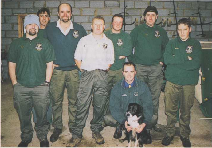
Below: The Westerham greenkeeping team with Lossie, the extra member