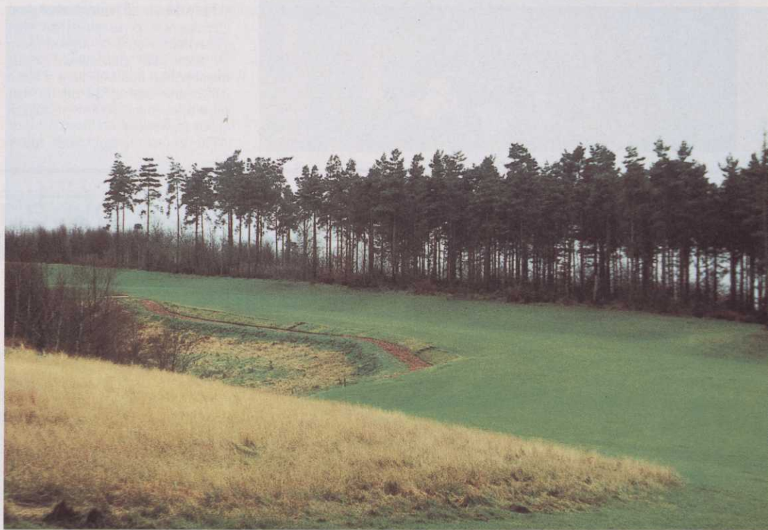
Above: The course is carved from a wonderful piece of land