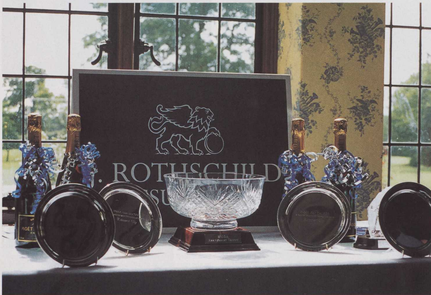
Above: To the winners go the spoils