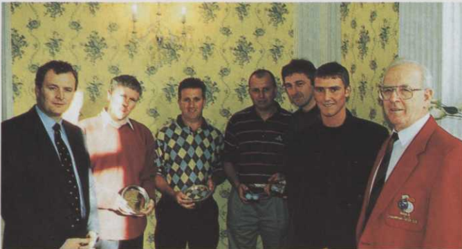
Below: Rothschild 2 were the best placed sponsor's team in third