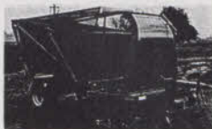
Machines can be hired

COMPOSTERS - COMBI CUTTERS Grass Cutting and Leaf Vacuuming with collection. The Combi-Trailer and Flail Cutter is for medium height grasses, park grass, sports grounds, golf courses, etc.