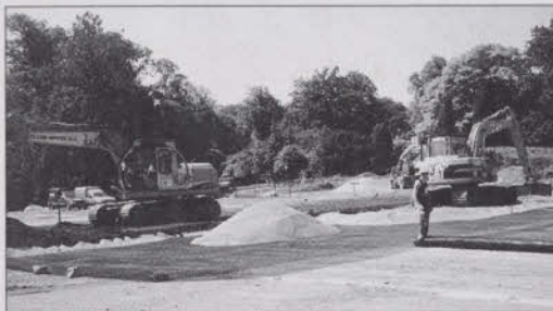
Football pitches for Glasgow University

A Specialist Contractor to the Leisure Industry