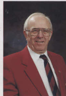
74 As I see it...