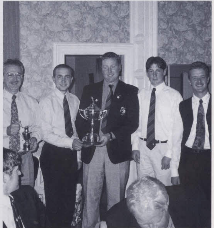
The victorious West Section receive their trophies