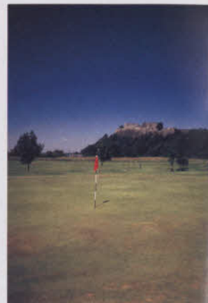
23 Stirling Service

Find out what went on at Windsor this year