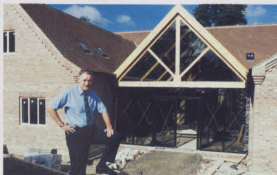
16 Past, Present and Future