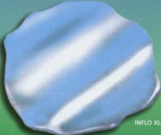
Conventional wetting agent

Inflo XL's ability to reduce the surface tension of water, is up to 25 times better than conventional wetters, and its non-scorch formulation means no need to water in.