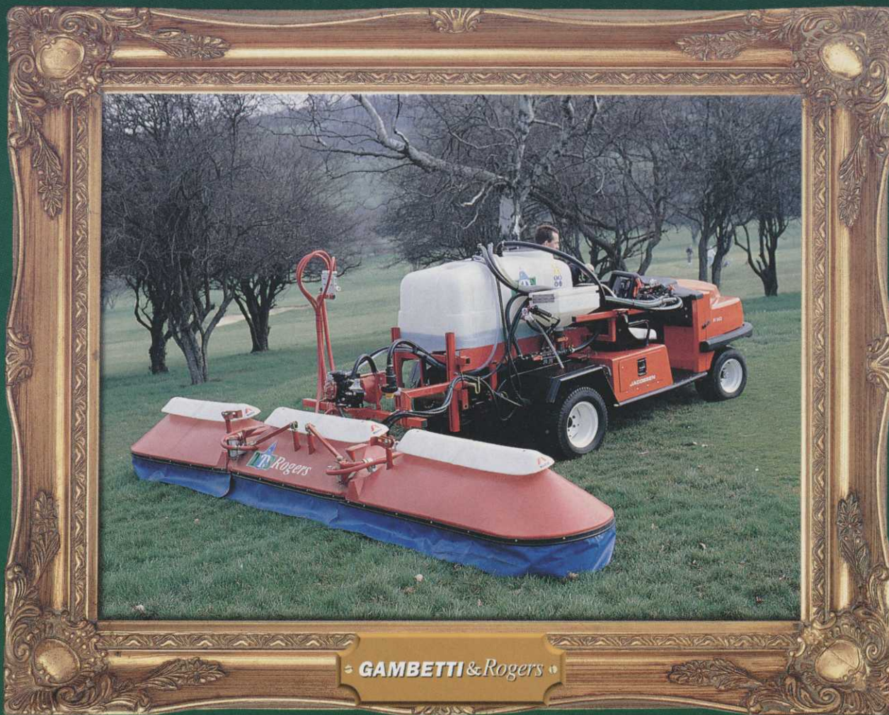
GAMBETTI & Rogers