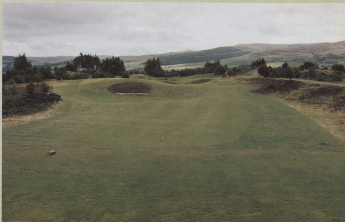
A fine example of strategically placed hazards

five holes and only 44 (originally just 29) bunkers. The key to Augusta's defences is for anyone looking to attack these awkward pin placements (not just to score well, but to avoid almost certain three-putting, on heavily contoured greens) a second shot needs to be played from close to a strategically located fairway hazard, at drive length. This simple strategy is truly effective, as usually only a few usually break par.