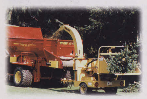
Attach any tow type chipper and do all your winter clean up in a fraction of the time and cost.