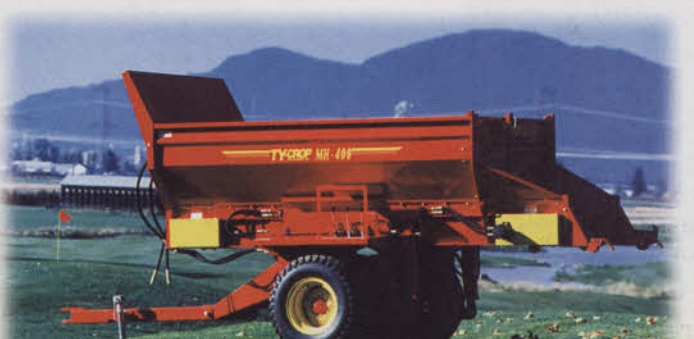
Exceeding our customers expectations for performance and reliability since 1978.