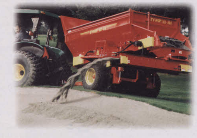
Fill bunkers and traps, build retaining walls... Perfect for construction and renovation tasks. Reach over 15 feet from the back of the unit.