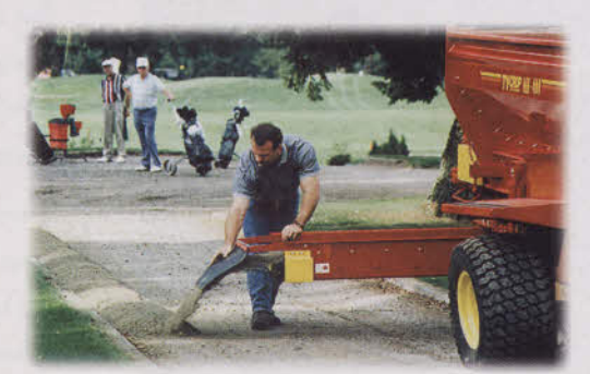
Backfill ditchlines, build cart paths, or place wood chips and compost around trees, plants and in flower beds. The cross conveyor can move in any direction.

Material handling is a long term proposition... with exceptional versatility the MH-400 is your best long term solution.