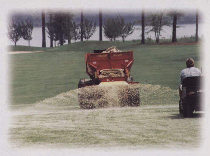
Topdress large areas from 15 to 40 feet wide in minutes using sand, lime, gypsum or compost, without disrupting play.