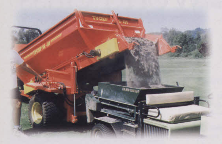
Load small topdressers and work vehicles in only 7 to 10 seconds, no wasted travel, no labor.