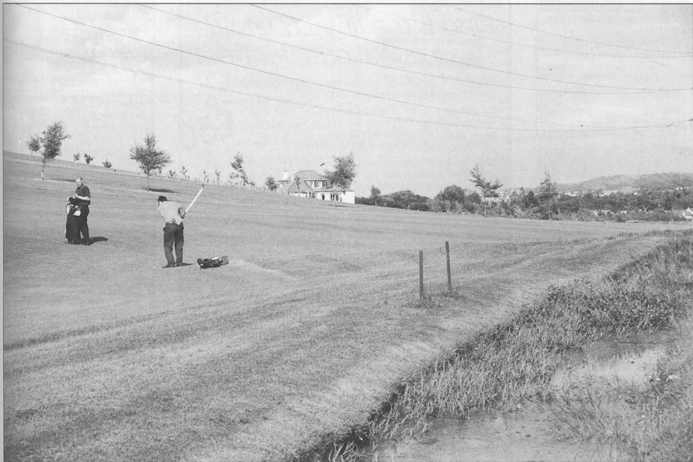
Two or three water features are to be created utilising the existing ditch. These will be constructed to benefit wildlife and golfer by their gently contouring, strategic positioning and natural characteristics.

greenstaff at no extra cost. The environmental benefit of such steps will be, considerable.