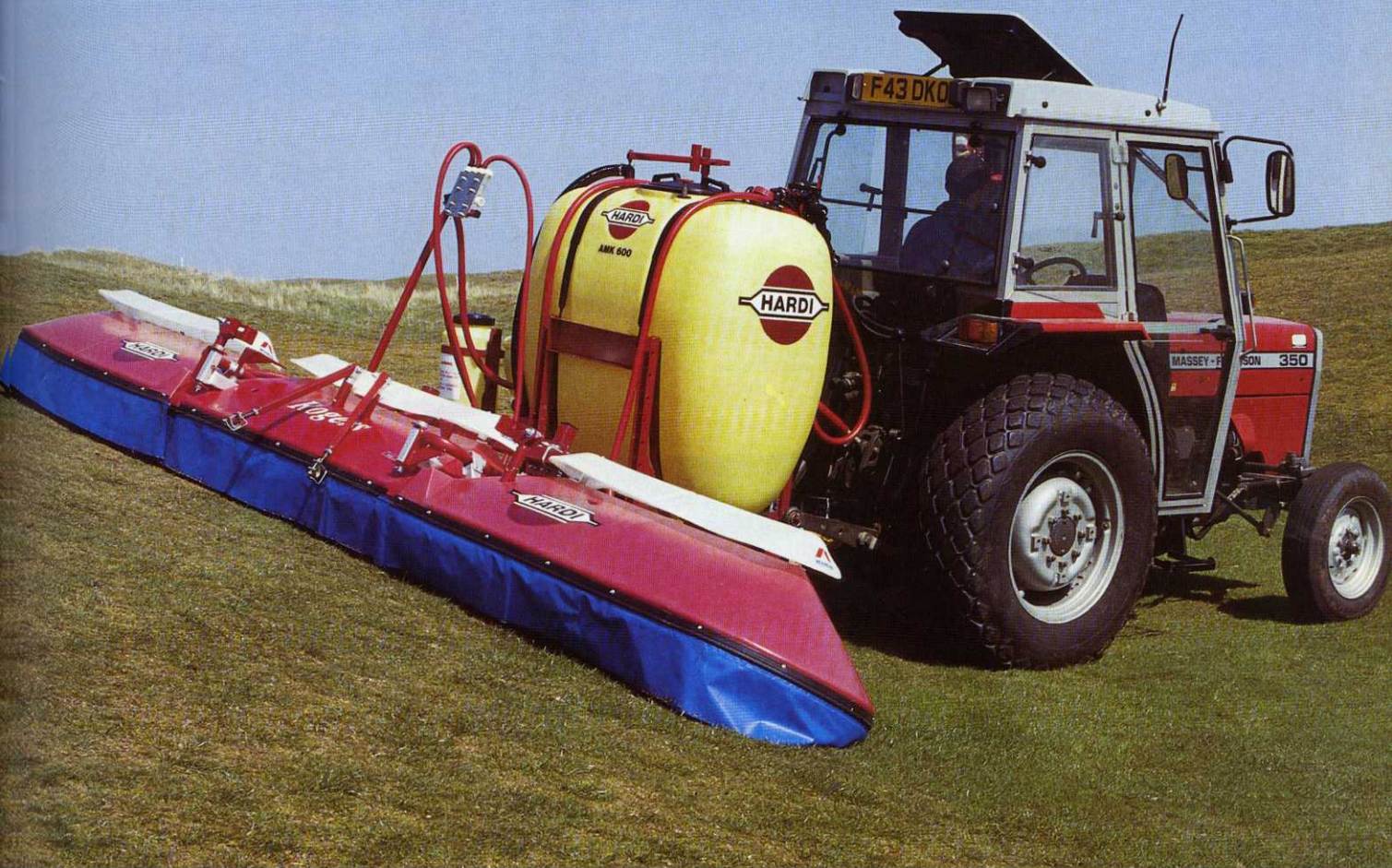
The AMK 600 and Rogers