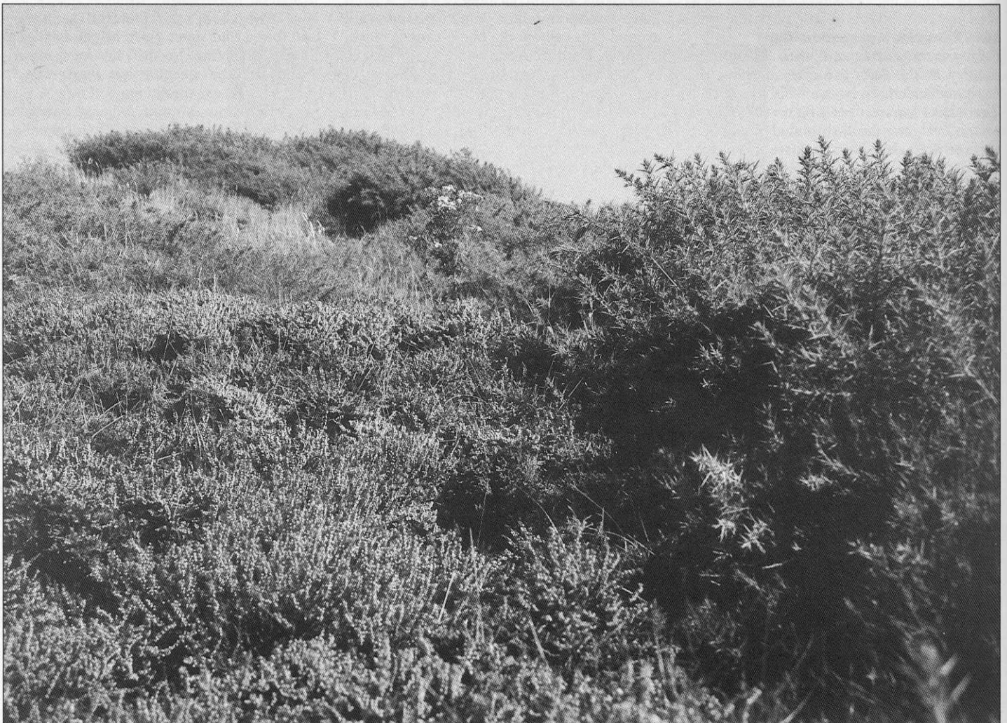
An example of the threat to the heathland – gorse encroachment. Measures to control the spread of gorse and rank grasses are to be implemented. One of those measures involves reducing the amount of trolley damage to the heather stands.

Internal projects which will not require capital funding are being taken on by Head Greenkeeper, Rory Campbell. Grassland management for wildflowers, increasing the amount of rough grassland, sensitively disposing of cuttings and adoption of a policy for Integrated Pest Management are all being undertaken by the