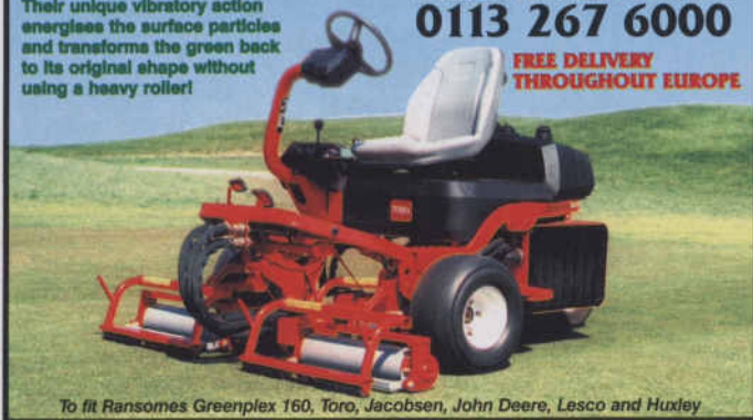
To fit Ransomes Greenplex 160, Toro, Jacobsen, John Deere, Lesco and Huxley