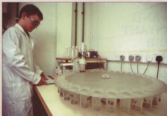
Soil analysis under rigorous clinical conditions

As the saying goes, the answer lies in the soil, but you have to ask the right questions.