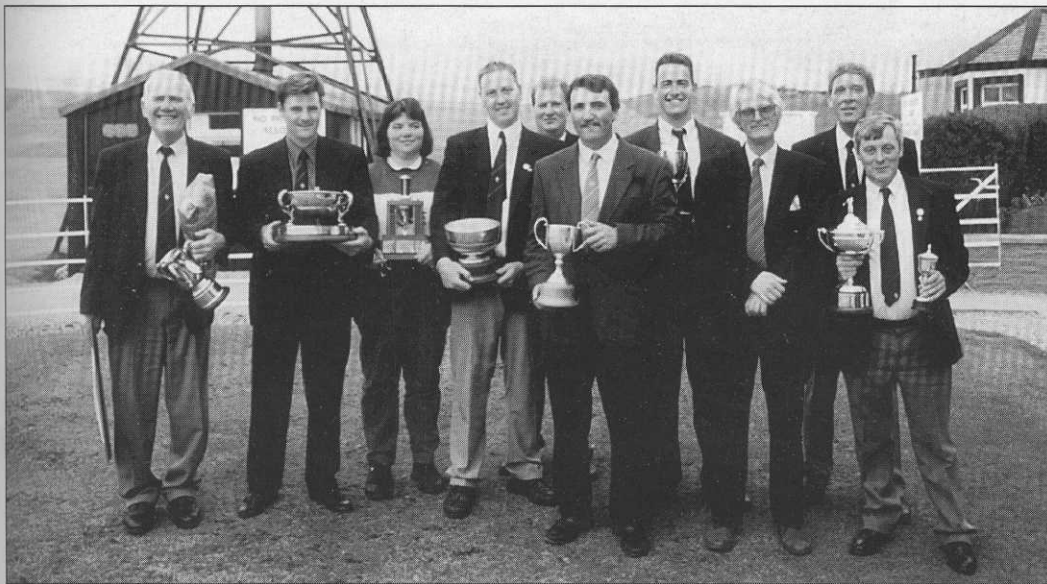
Scottish National Tournament winners – and their silverware