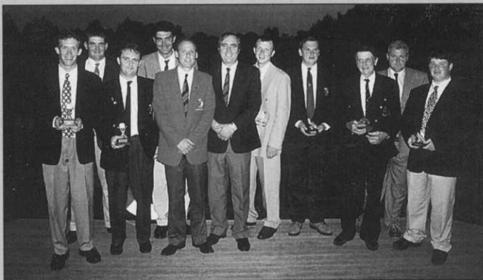
Prize winners at Benton Hall