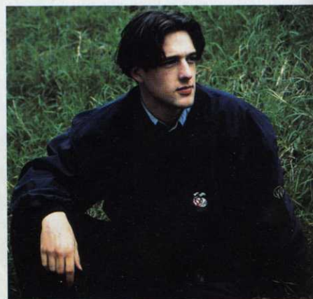
Walrus slipover: Free when you buy a Walrus rainsuit or just £17 if bought separately

PAY BY VISA, MASTERCARD OR CHEQUE • PHONE VICKIE WITH YOUR ORDERS ON 01347 838581