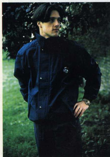
Walrus rainsuit: Simply the best quality and complete with BIGGA logo

Buy a Walrus rainsuit and get a Walrus slipover (usual price £18.95) ABSOLUTELY FREE!