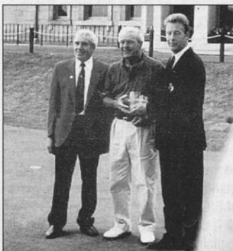
Presenting the BIGGA trophy for achievement to Arnold Palmer