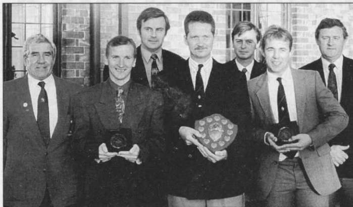
The Toro/PGA European Tour Student Greenkeeper of the Year presentation