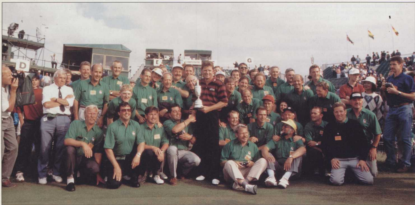
Flashback to last year: Members of the BIGGA support team with champion Nick Price