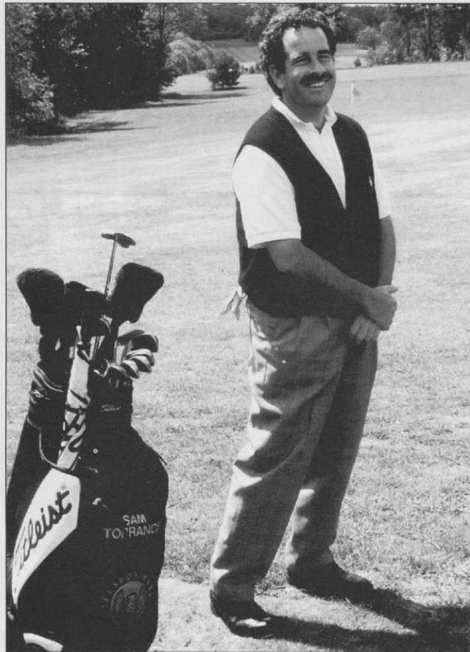
Selsdon Park Hotel in South Croydon is the home to the first Bob Torrance Golf Academy.