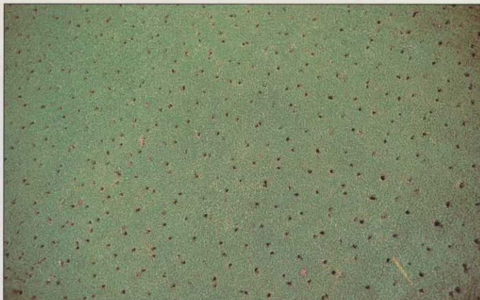
Results of Verti-draining after hollow-coring

are being rebuilt to a USGA-spec at the rate of two a year. Nine greens are left to do in the next four years.