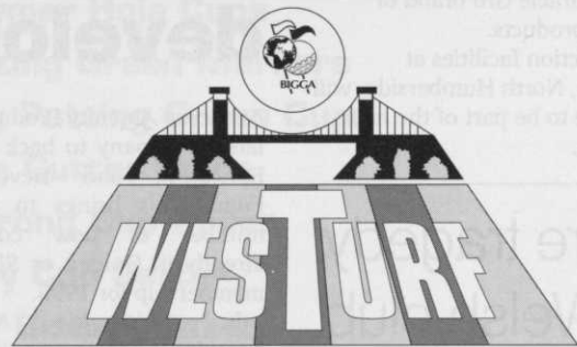
Exhibit on 26 April 1995 at Long Ashton Golf Club, Bristol