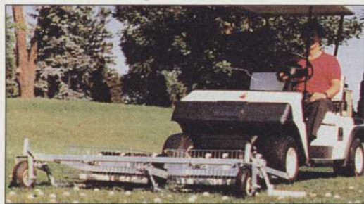
The Acrow Ballpicker A pedestrian model is also available