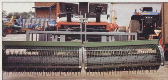
The RTS "Sorrel Type" Roller A pedestrian model is also available