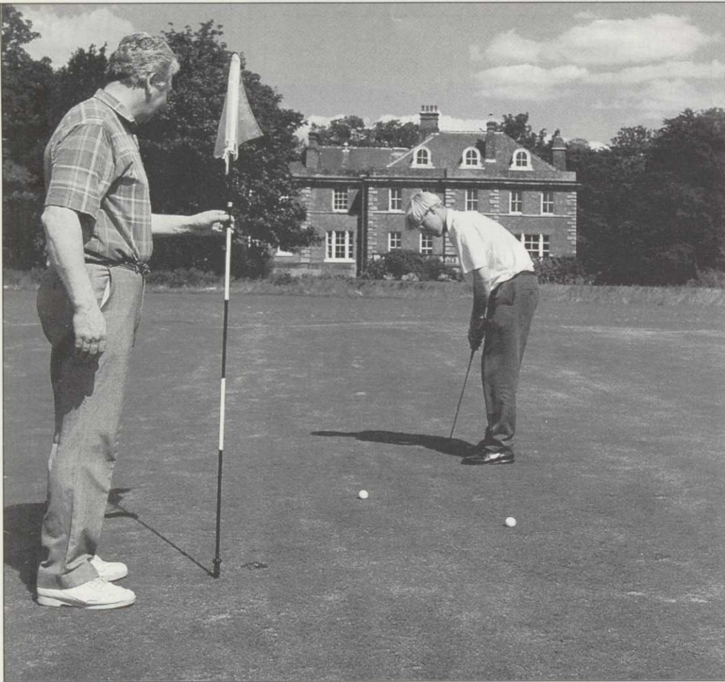
Putt-ing in the effort to make a success of a new course: Hirst Priory opens in the spring