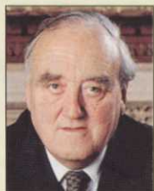
President The Rt. Hon. Viscount Whitelaw K.T., C.H., M.C., D.L.

Official publication of the British & International Golf Greenkeepers Association MARCH 1994