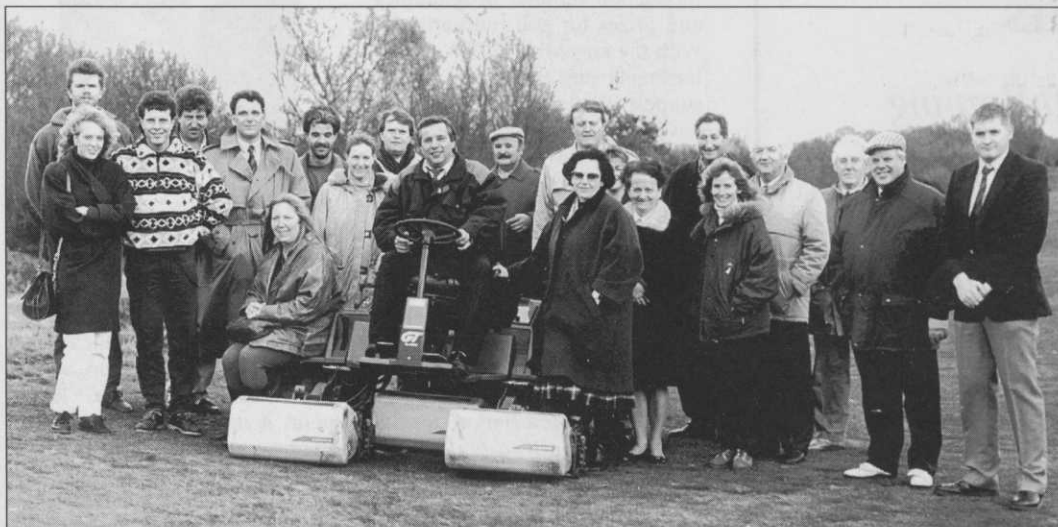
A group of Swiss greenkeepers try out the latest machinery from Ransomes during a demonstration at Woodbridge Golf Course. The greenkeepers were accompanied by their wives and representatives from Ransomes in Germany during the visit to the UK.