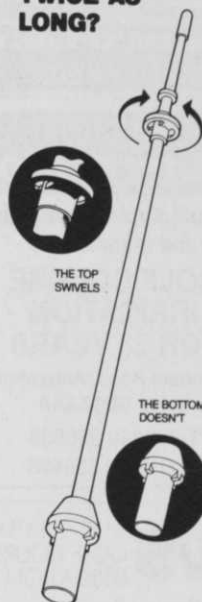
THE TOP SWIVELS