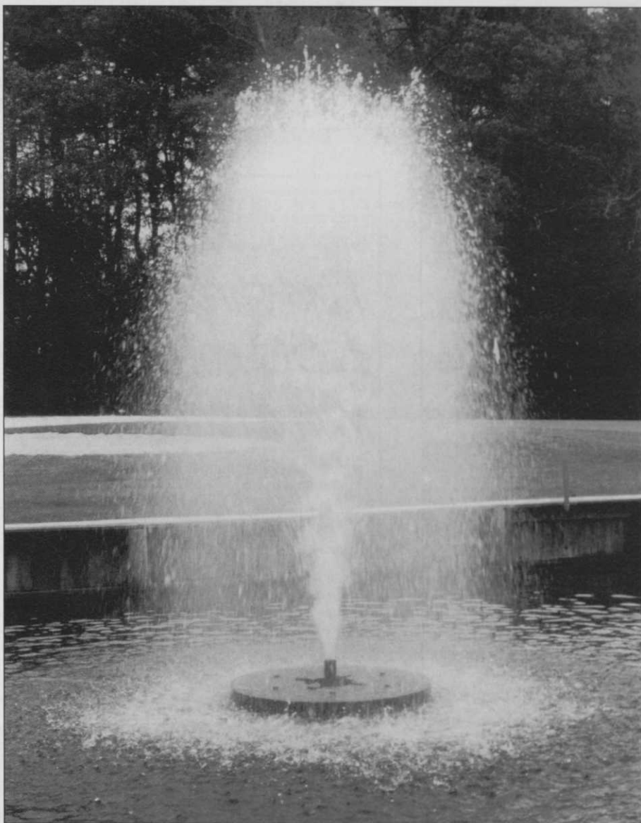
Fountains like this – and much larger models – help water to circulate and provide additional oxygen

In days of yore, many a lake or pond was left to its own devices until the stinking, slimy contents forced those responsible to take action. Then, it was mostly a question of dis-