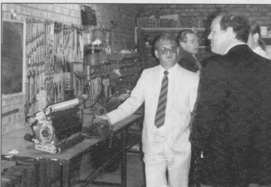
Left: members take a look round the workshops