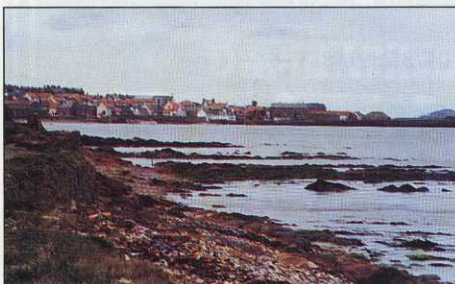
Dunbar town, as seen from the links' edge