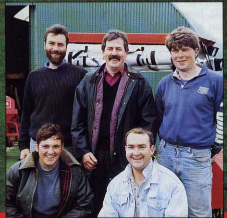
The Dunbar crew