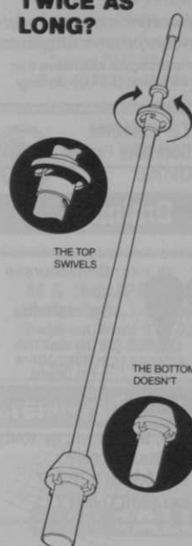
THE TOP SWIVELS

WHY DOES TACIT'S FLAGPOLE LAST TWICE AS LONG?