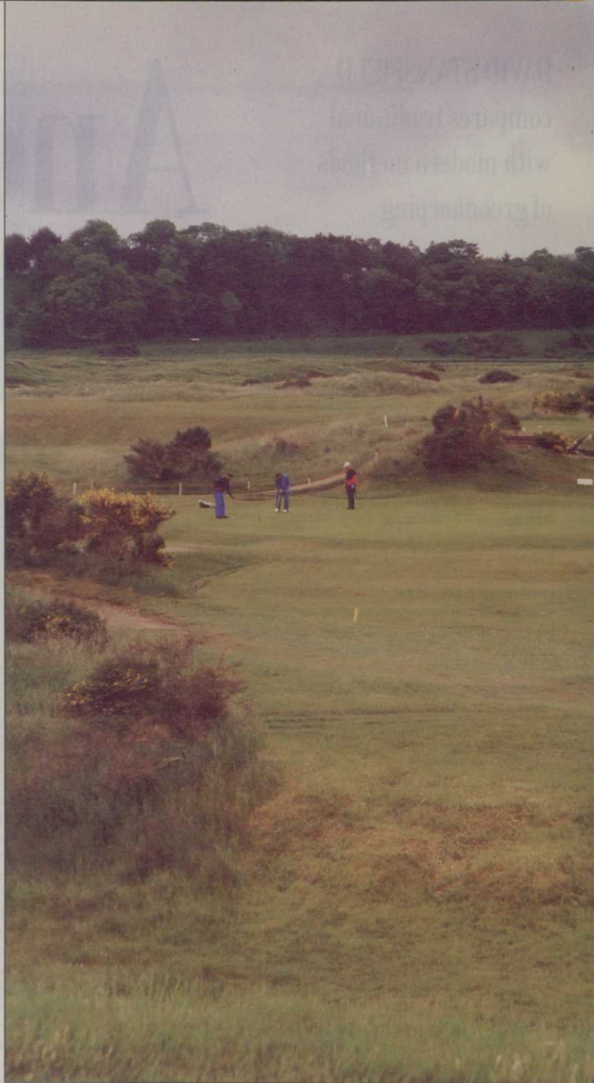
Above: 'A monument to Old Tom Morris'