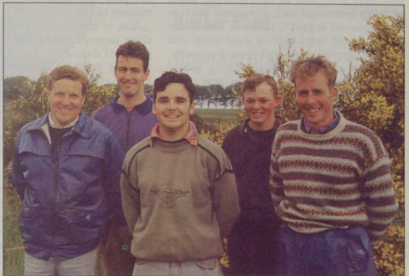
Below: Current custodians - the greenkeeping crew