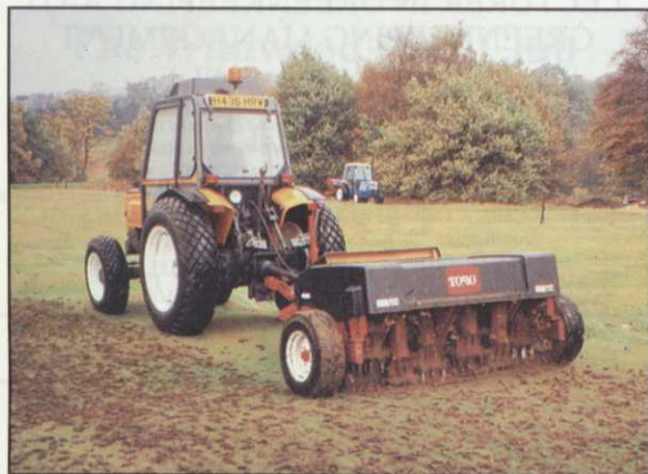
THE TORO FAIRWAY AERATOR