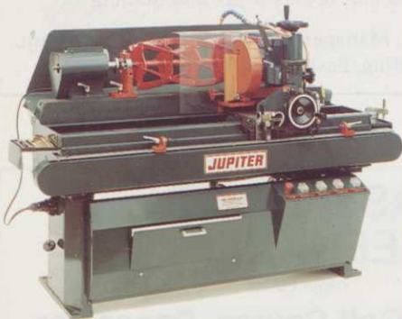
42" capacity Mower Cylinder and Bottom Blade Grinding Machine. A truly "precision" grinder, built to last half a century. Used and preferred by Professionals.