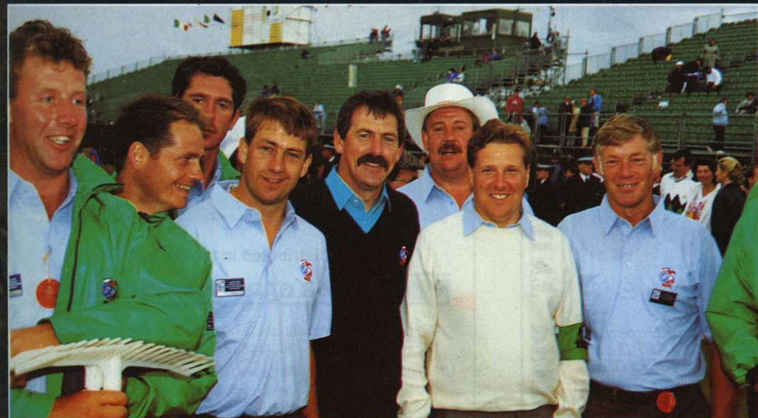
Happy faces at the finish