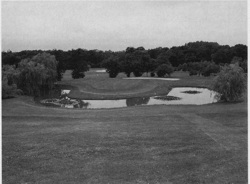
Utilisation of natural contours enables the golf course to blend into the surrounding countryside, as in this example on Meon Valley Golf and Country Club

■ LATE NEWS: The Government has just announced proposals which would require formal environmental assessments for golf courses if the proposal is in a national park, an