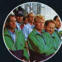
Tension mounts over the last few holes...