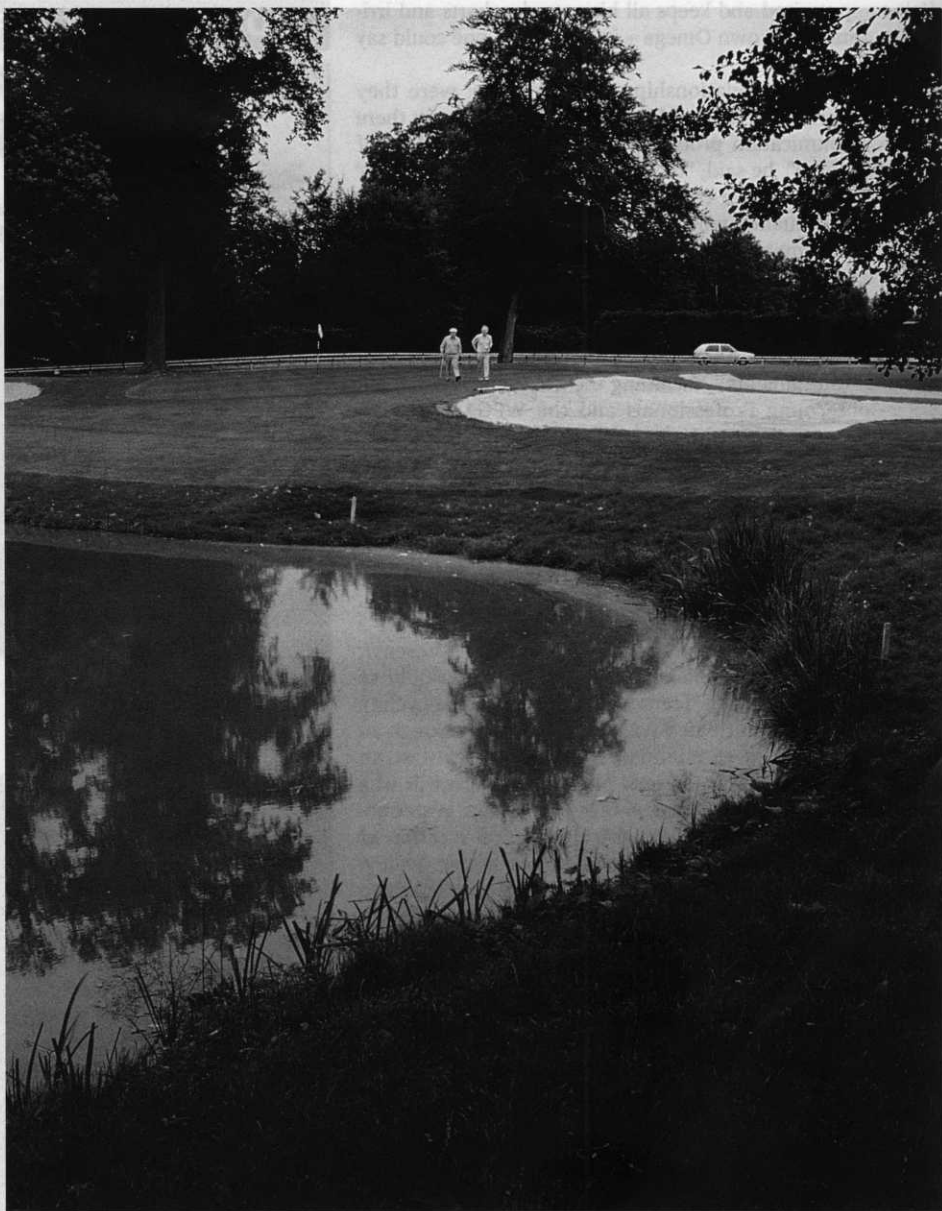
Incorporation of existing trees and natural water bodies into the design enhances the environmental value of the course as in this example on Meon Valley Golf and Country Club

The EA may also offer benefits in terms of the developer's relationship with the local community. The assessment might include a dialogue with local residents and representatives of nature conservation groups who are