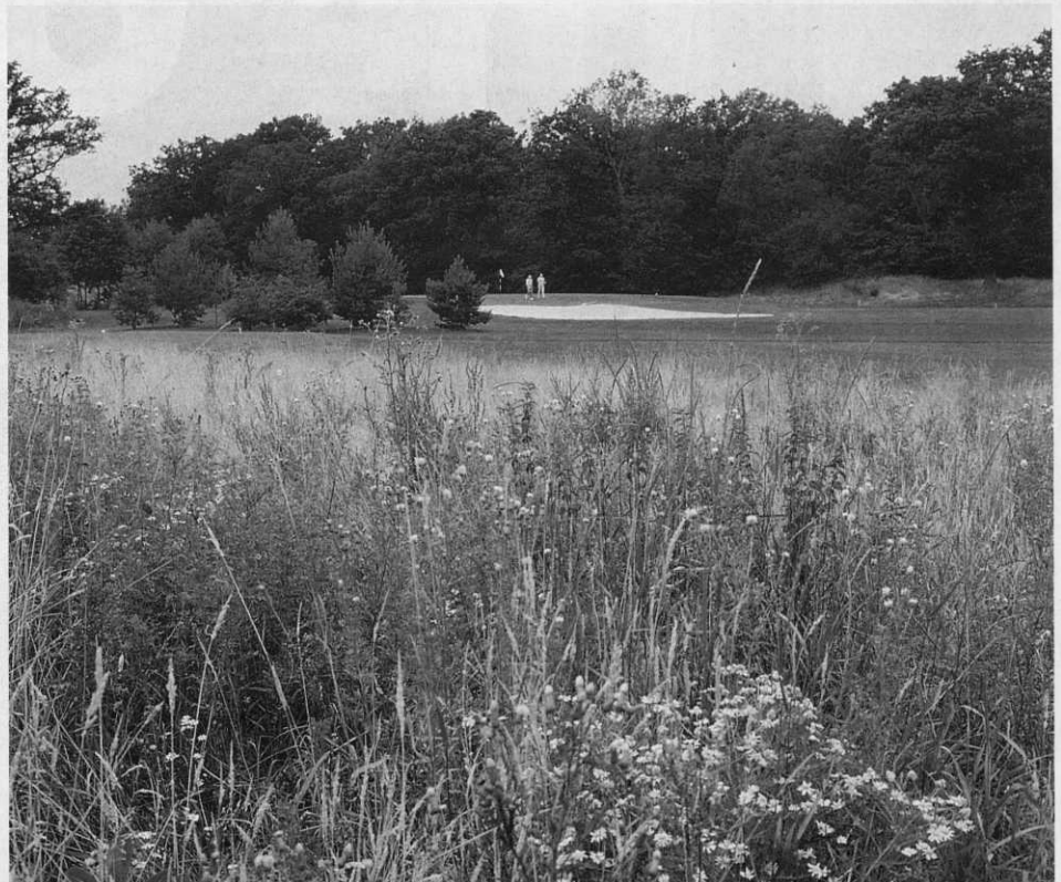
Letting the rough grow wild encourages a diverse habitat for both flora and fauna as in this example on Meon Valley Golf and Country Club

AONB, an SSSI or a heritage coast. Golf courses proposed in so-called 'historic landscapes' may also require environmental assessment. At this stage, the proposals are included in a consultation paper issued by the D of E but they are expected to be included in regula-