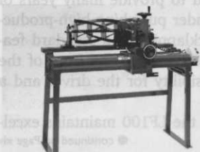
The Hunter JUNO Grinder

Hunter Grinders, based in Newcastle On Tyne, seem to have perfected the latter method to a high degree of accuracy, which is rocking established trains of thought and bruising long-held prejudices. From the growing numbers of greenkeepers willing to endorse Hunter's products and methods it seems the argument is almost won.