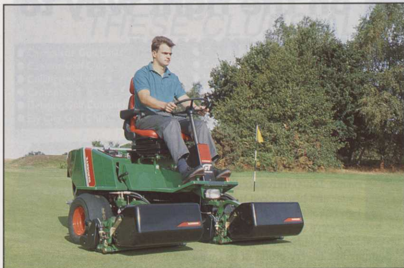
The Ransomes GT Champion

● from Page xi accurately in cuts per metre or clips per inch by digital read-out.