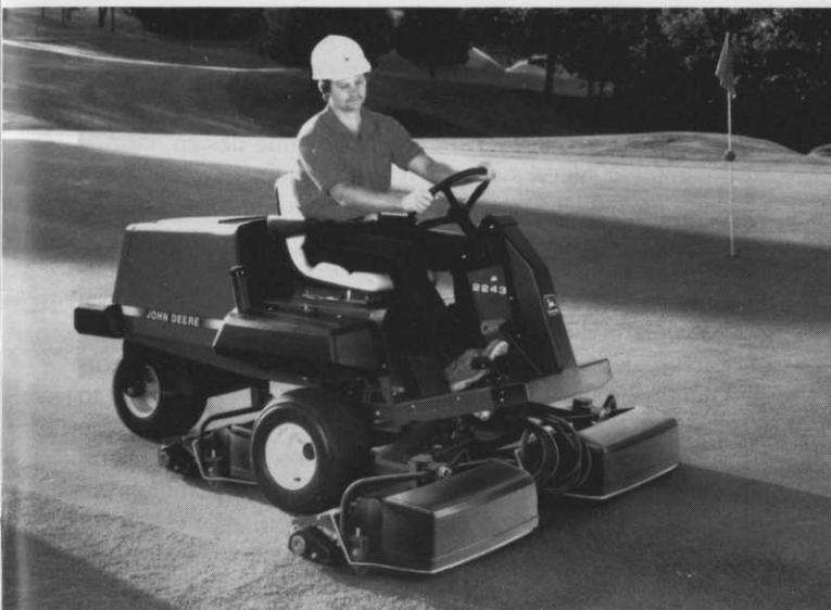
The John Deere 2243 Professional Greens Mower.