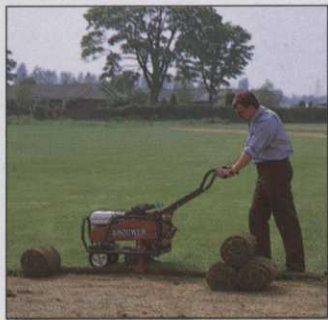
The Brouwer turf care team includes a roller, mini turf cutter, five gang fairway mower and a vac.