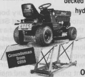
Groundsman from £659

hydraulic bench to raise the standard of your working conditions.