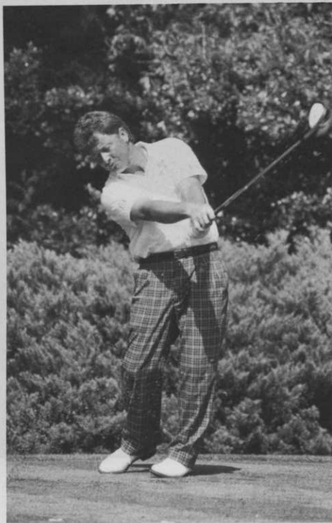
Ian Woosnam, the '91 Masters Champion

33 ➔ towards us, including his waiving of the dress rules in order to accommodate those amongst us who had NOT BROUGHT JACKETS! HONESTLY, I was ashamed. Please remember that not only are we guests in the Clubs we visit, but also ambassadors for greenkeeping and greenkeepers. This means dressing correctly and projecting a professional image. I certainly felt the standard of dress at lunch left a lot to be desired, never mind expecting to be allowed into the Club at evening time without a jacket. Please remember to dress correctly at all times in future.†