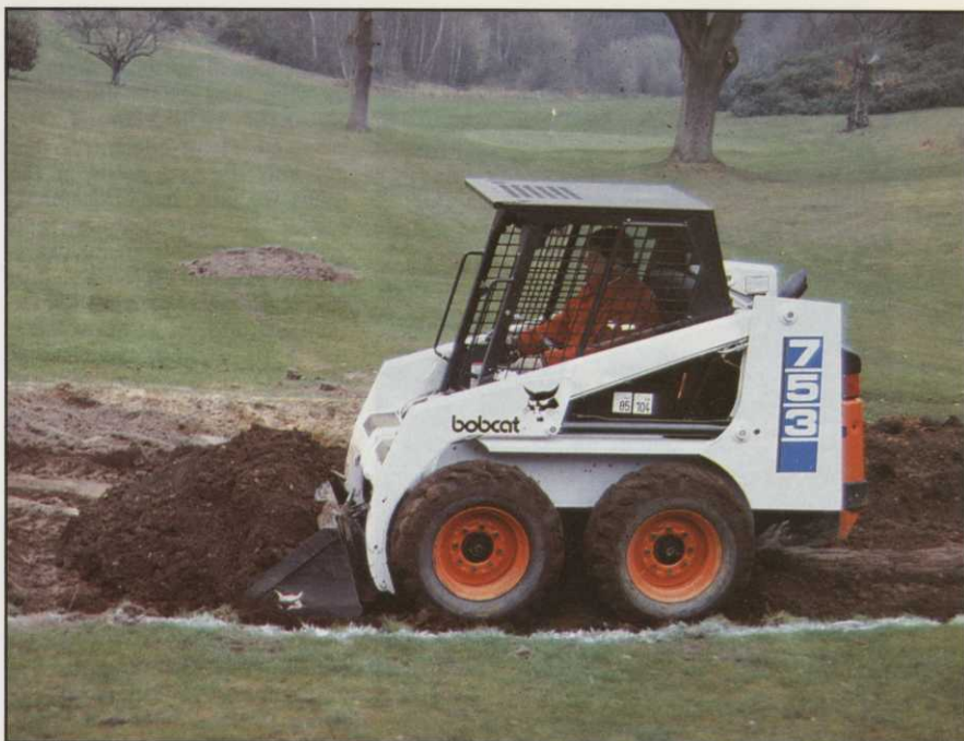
Bobcat 753 in action at Pennyhill Park

Of the course itself, it is another that claims no architect. Built just ten years ago, it has impossibly sloping greens, is on one of the highest points in Surrey – with resultant drying winds a constant negative factor – and has only about 1" of topsoil in some places. It has no automatic irrigation yet