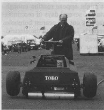
The Toro HydroJect 3000, seen here in action at Westurf '91, deploys two additional swing-up wheels for transportation

The equipment needed for water-injection cultivation is the Toro Hydro-Ject 3000, which incorporates a pump; an accumulator; a single valve and set of nozzles. Once the unit is filled with water (it uses approximately 150 gallons to aerate a 7000 square foot green), the positive displacement pump maintains a constant 5000 psi water pressure on the system accumulator, which acts like a capacitor in an electrical circuit. Output from the accumulator is controlled by a valve which, when opened, releases water to the nozzles in short cycles of a few milliseconds. On reaching the nozzles the water