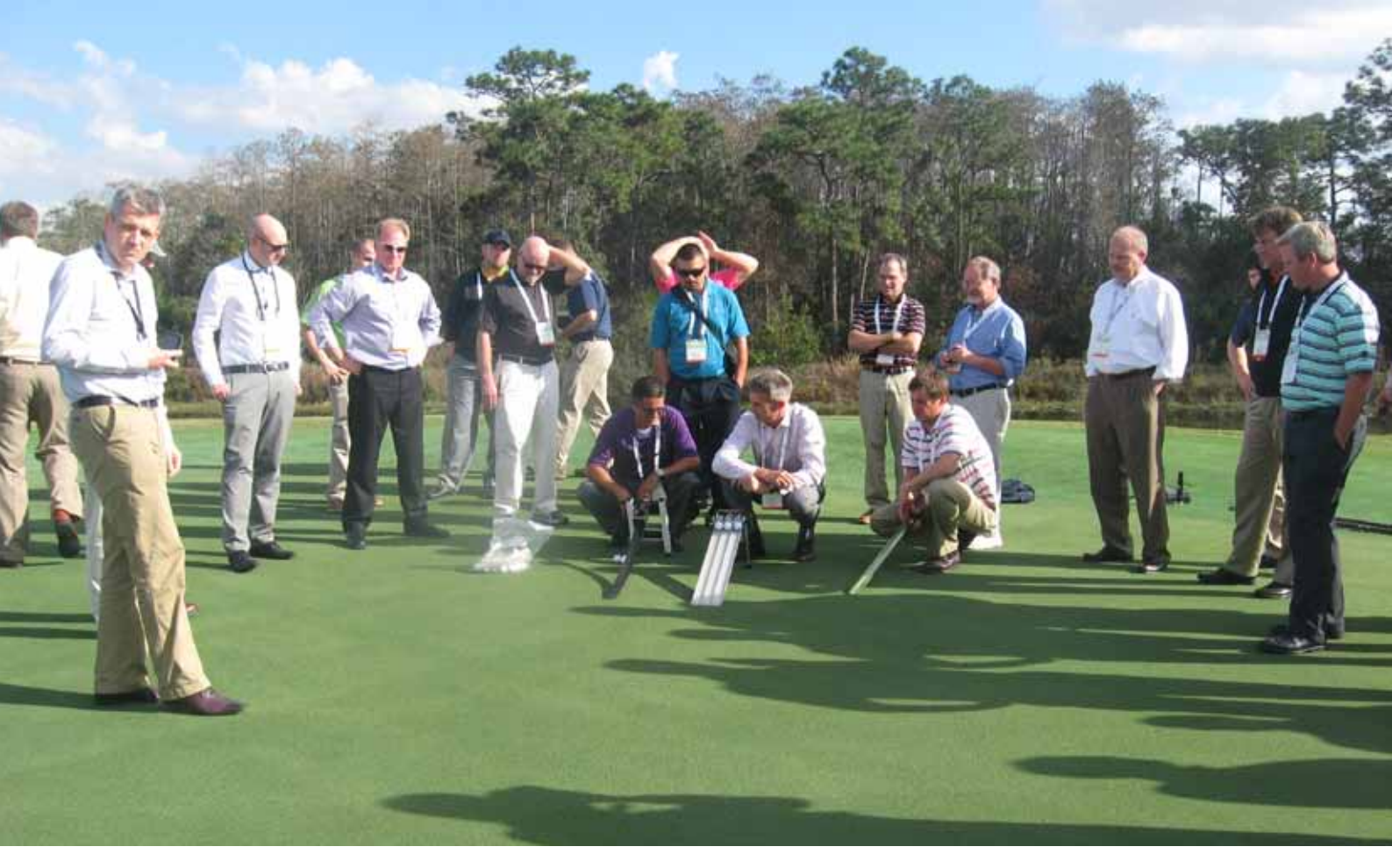
Wednesday 5 & Thursday 6 February The Golf Industry Show, Orange County Convention Centre

ABOVE: The delegates at Shingle Creek Golf Club