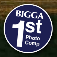
Craig Boath's stunning early morning shot of Carnoustie's Burnside Course