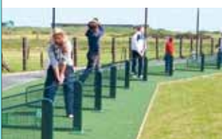
Huxley Practice Tee at St Andrews Links

Top quality practice tees, golf course tees, putting & pitching greens, pathways, patios, cart tracks and lawns professionally designed and installed.