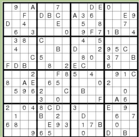
Monster Daily SuDoku: Tue 26-Feb-2013 very hard