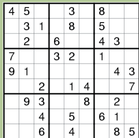
Daily SuDoku: Tue 26-Feb-2013 easy

Fill in the grid so that every row, every column and every 4x4 box contains the numbers 0 to 9 and the letters A to E.