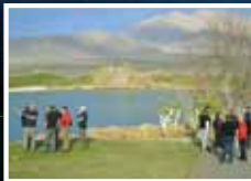
In August Greenkeeper International will again be asking for members to apply to become a member of the Bernhard's Delegation heading to the States and the Golf Industry Show in January.

It's a fabulous shared experience, an opportunity to build new friendships and make new business contacts, but most importantly an priceless tool for learning, observing, listening and growing. But don't just take our word for it. Go up to some of our delegates from the last decade to find out how much the trip influenced them professionally and personally.