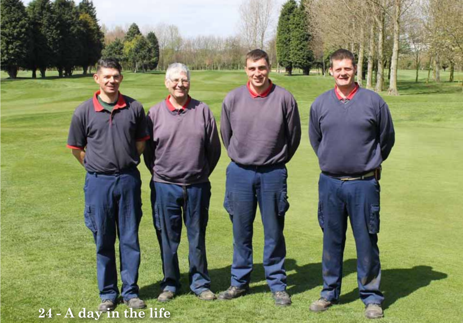
24 - A day in the life