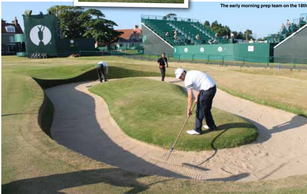
The early morning prep team on the 18th