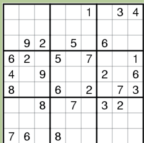
Daily SuDoku: Thu 28-Mar-2013 medium

Fill in the grid so that every row, every column and every 4x4 box contains the numbers 0 to 9 and the letters A to E.