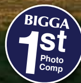
Craig Boath's stunning early morning shot of Carnoustie's Burnside Course