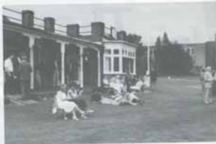
Some of the competitors and their wives enjoying the sunshine in front of Vero's clubhouse.