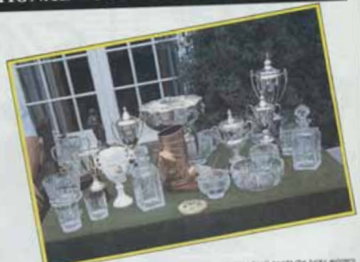
All set for the trophy table laden with "goodies" awaits the lucky winners.

David Wood's 61 proves too hot to handle