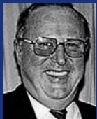
BIGGA President Sir Michael Bonallack, OBE