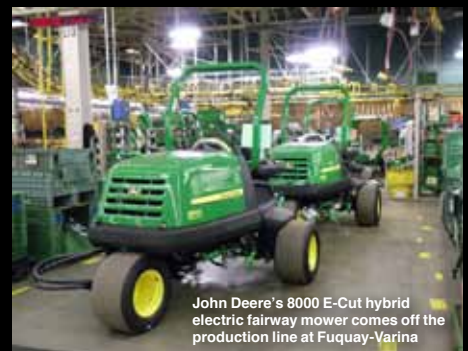
John Deere's 8000 E-Cut hybrid electric fairway mower comes off the production line at Fuquay-Varina

John Deere's five millionth lawn tractor, from the X700 Ultimate diesel range, rolled off the assembly line at Horicon in 2010, when the factory also manufactured its 500,000th Gator utility vehicle, following this popular machine's introduction in 1993.