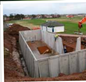
The initial cost of a reservoir can be recouped over a period of time and they provide an additional protective measure against drought orders