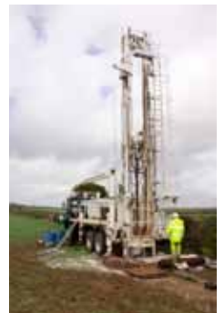
Some clubs have found the Environment Agency more receptive to borehole applications where an investment is being made in winter storage

Please see Page 63 for more drought news