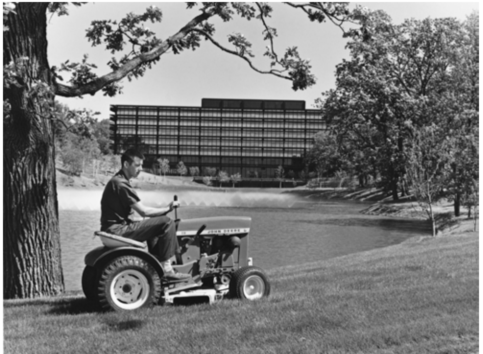
An original 110 lawn tractor, pictured here working in the grounds of the Deere & Company worldwide headquarters at Moline in the early 1960s, can be seen at the Smithsonian Institution's National Museum of American History in Washington, DC; a fully restored, working example of this pioneering lawn tractor is also on display in the foyer of John Deere's UK headquarters at Langar in Nottinghamshire.

The company now offers the broadest range of lawn & garden, commercial and golf equipment in the world.