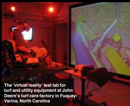
The 'virtual reality' test lab for turf and utility equipment at John Deere's turf care factory in Fuquay-Varina, North Carolina