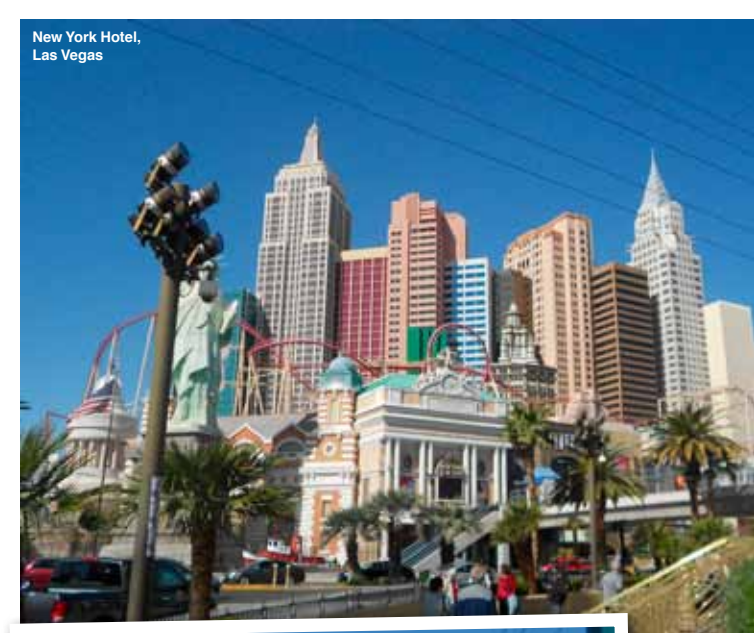
The Strip in Las Vegas

This just leaves me to say good luck to this year's nominees and to the eventual winner: get ready for the trip of a lifetime!